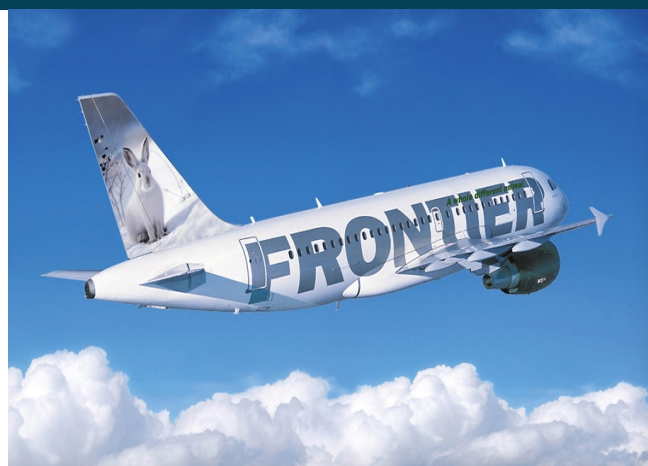
Frontier Airlines at Trenton Mercer